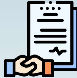
NUMBER OF CONTRACTS