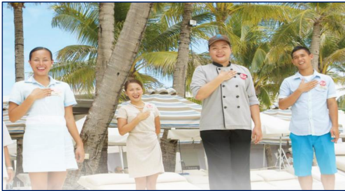
Safety and protection of workers, visitors and communities