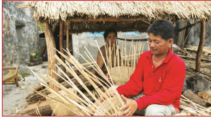
Enterprises and job recovery supported