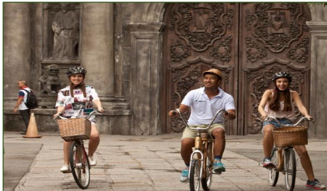
Market confidence restored